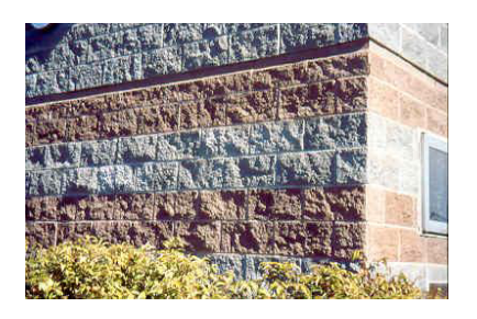
Combination of coloured split ledge and natural splitface