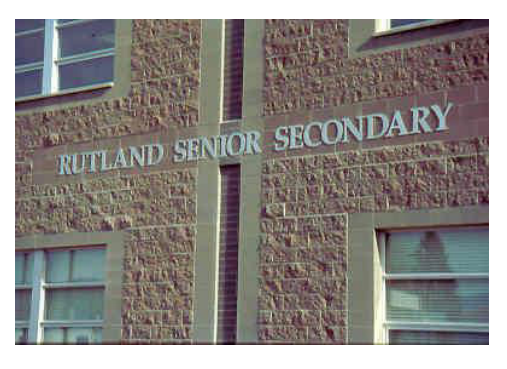
Combination of coloured splitface with natural smooth units framing the windows and half-high smooth in vertical recess.