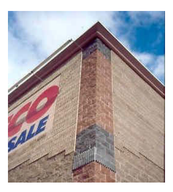
Multiple Coloured splitface and 6-rib

Ribbed and Ledge profiles allow the designer to play with light and shadow, both vertically and horizontally, to achieve unique design effects which change with the direction of the sun through-out the day. They are produced by combining custom moulds with the splitface technique described above.